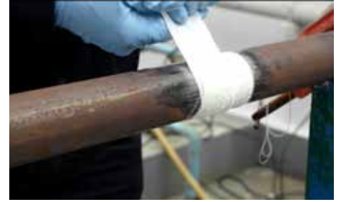
3. Apply wrap