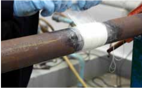
4. Apply film