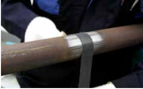
1. Roughen and clean surface