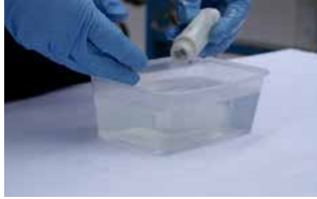
2. Soak wrap