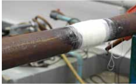
5. Application complete